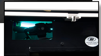
Parcel Rack Install